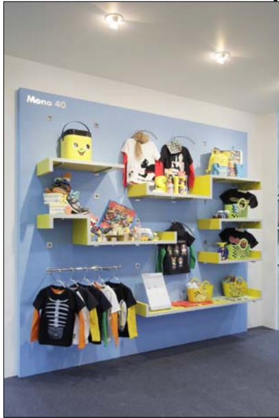
011.JPG 5009.23 KB 2592x3888x24(RGB) 350x350 dpi