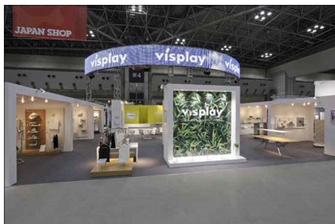
002.JPG 9358.57 KB 3888x2592x24(RGB) 350x350 dpi