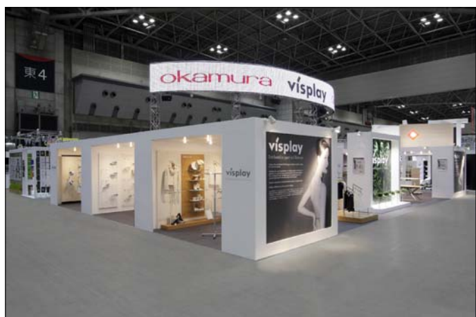
001.JPG 8558.82 KB 3888x2592x24(RGB) 350x350 dpi