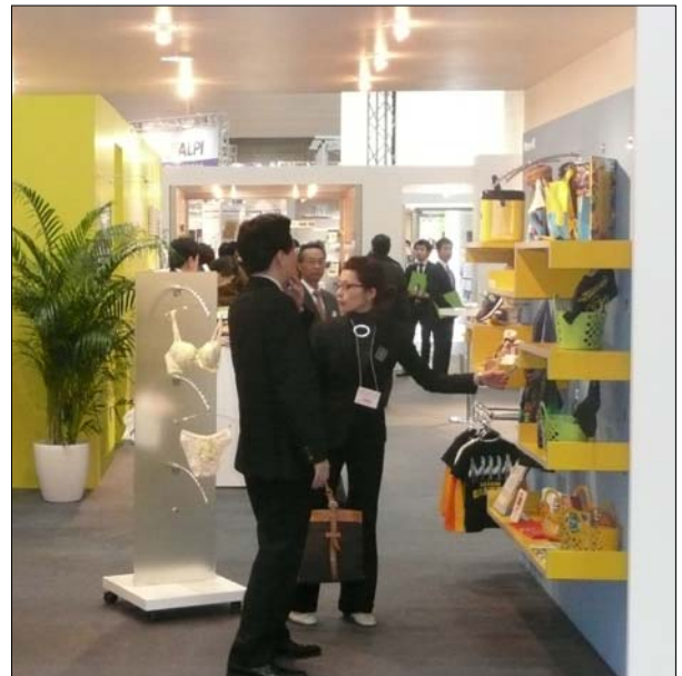
P1020809.JPG 1315.99 KB 1728x1752x24(RGB) 72x72 dpi