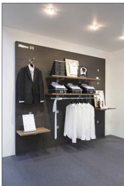
006.JPG 4696.36 KB 2592x3888x24(RGB) 350x350 dpi