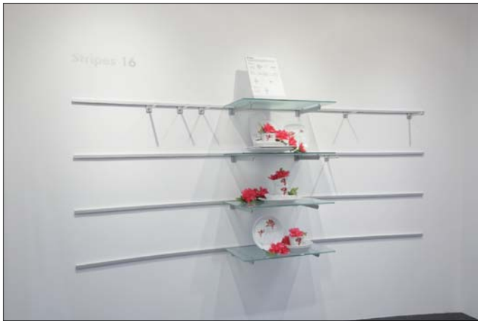
019.JPG 3557.07 KB 3888x2592x24(RGB) 350x350 dpi