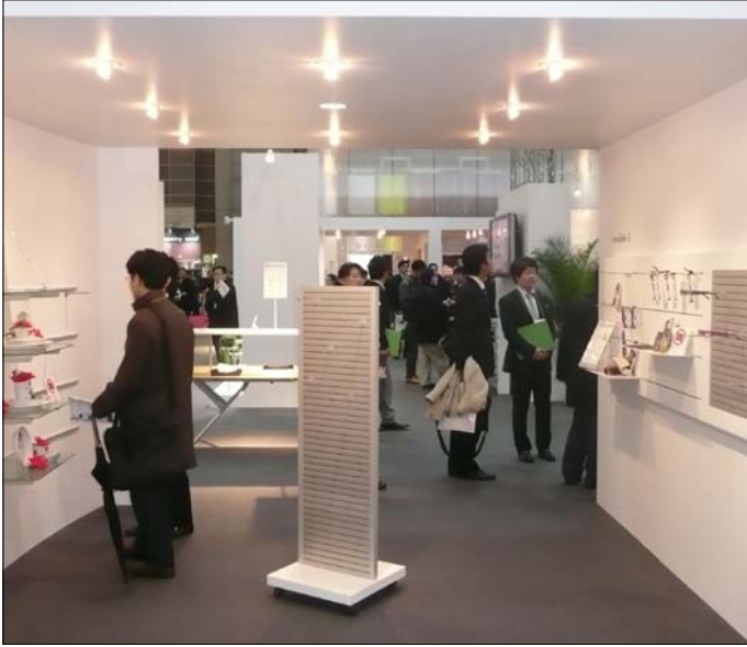
P1020823.JPG 1349.91 KB 2166x1872x24(RGB) 72x72 dpi