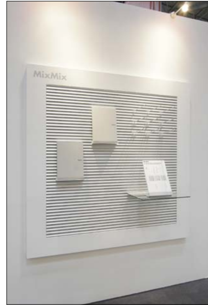
017.JPG 3829.77 KB 2592x3888x24(RGB) 350x350 dpi