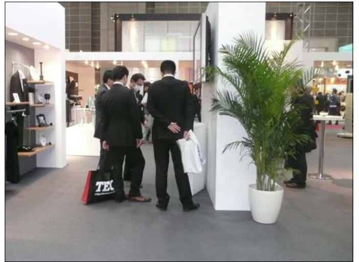
P1020848.JPG 1800.87 KB 2508x1872x24(RGB) 72x72 dpi